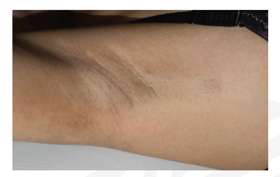
6 months follow up after 5 treatments

LightSheer INFINITY, High Speed handpiece, 1060 nm wavelength Skin type IV, Fluence: 12 J/cm<sup>2</sup>, Pulse Duration: 50-100 ms