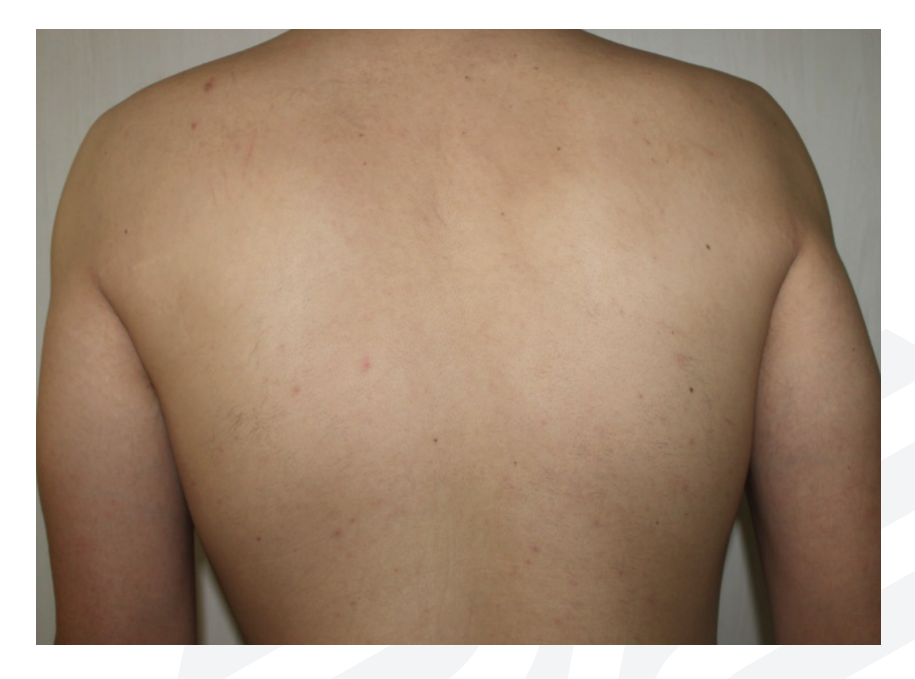
6 months follow up after 5 treatments

LightSheer INFINITY, High Speed handpiece, 1060 nm wavelength Skin type IV, Fluence: 6-7.5 J/cm<sup>2</sup>, Pulse Duration: 30 ms